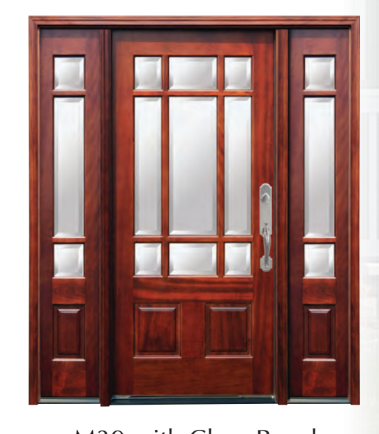
M39 with Clear Bevel